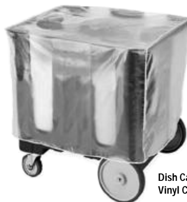
Dish Caddy with Vinyl Cover